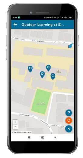
Figure 1. Math Trails

From the interview, it is known that junior high school uses the 2013 curriculum. The learning process which tends to be passive and does not involve students makes learning activities boring and minimal interaction. The characteristics of students who tend to be passive due to being accustomed to online learning. In addition, it is also known that students have difficulty solving problems in the form of stories or contextual problems. Meanwhile, the media used in learning tend to be passive and only convey material. There is no media that can actively involve in building their knowledge. So, we need the learning activities that can actively involve students in the learning process. In addition, media is needed that can bring students closer to learning resources and deal with contextual problems. Observations were also conducted in the school environment to determine which objects would be used as stopping points on the Mobile Math Trails. The math trails can see in Figure 1.