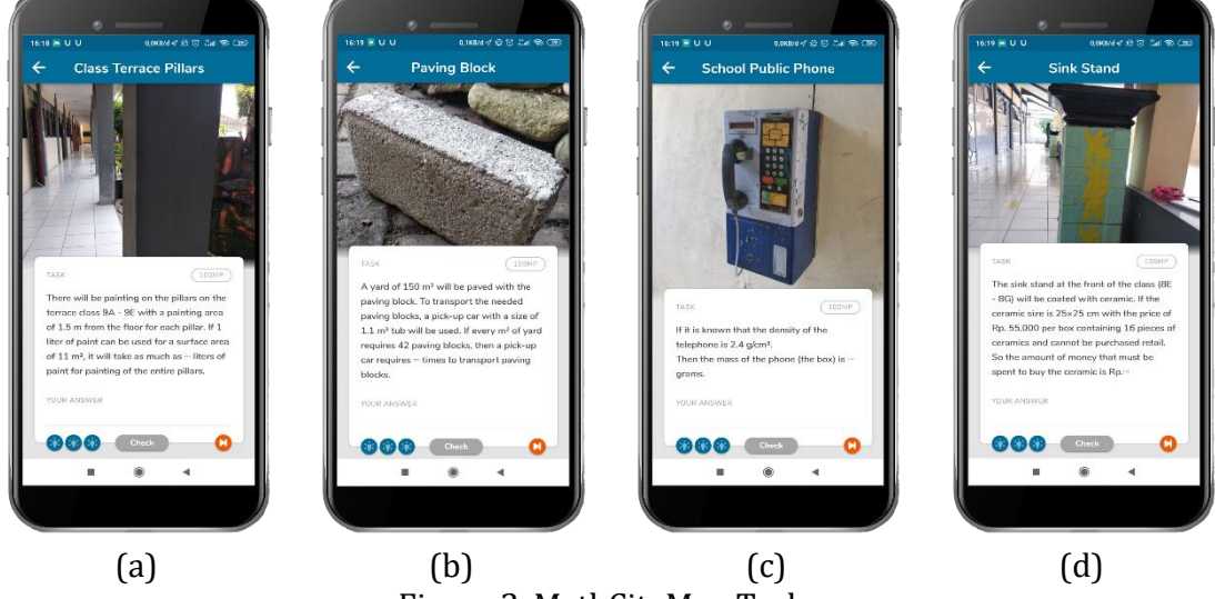
Figure 2. MathCityMap Tasks

The HLT was designed based on the results of interviews, observations, discussions with supervisors, and literature studies. Then the author designs learning activities according to HLT in the form of lesson plans and MathCityMap (MCM) tasks. The MCM tasks can see in Figure 2.